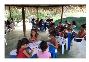
Bible Class study at the Chapeu de Palha 2021

You can see they come to Christ at their own free will !!