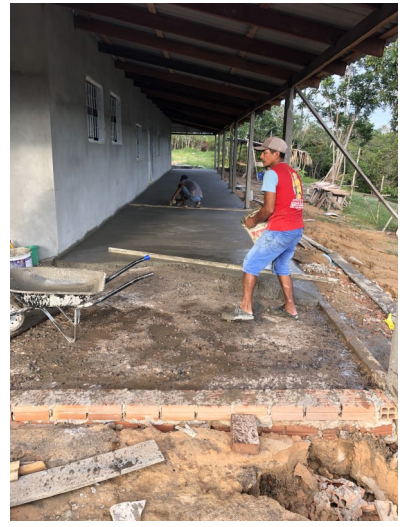
Pouring the front porch!!! The front porch roofing is completed!!

The Mission home is fully tiled in ceramic. Stela and I have been applying the grout and are about 90% finished as of today. We have also started to paint.