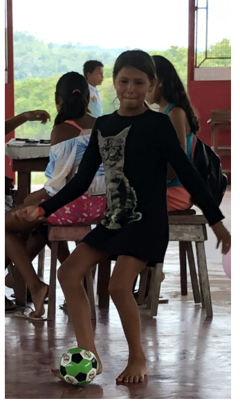
Marvel not that I said unto thee, Ye must be born again. John 3:7